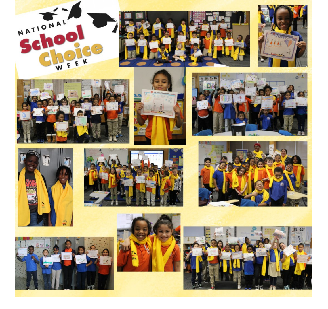
Imagine Schools of Akron students showed off their school choice scarfs.