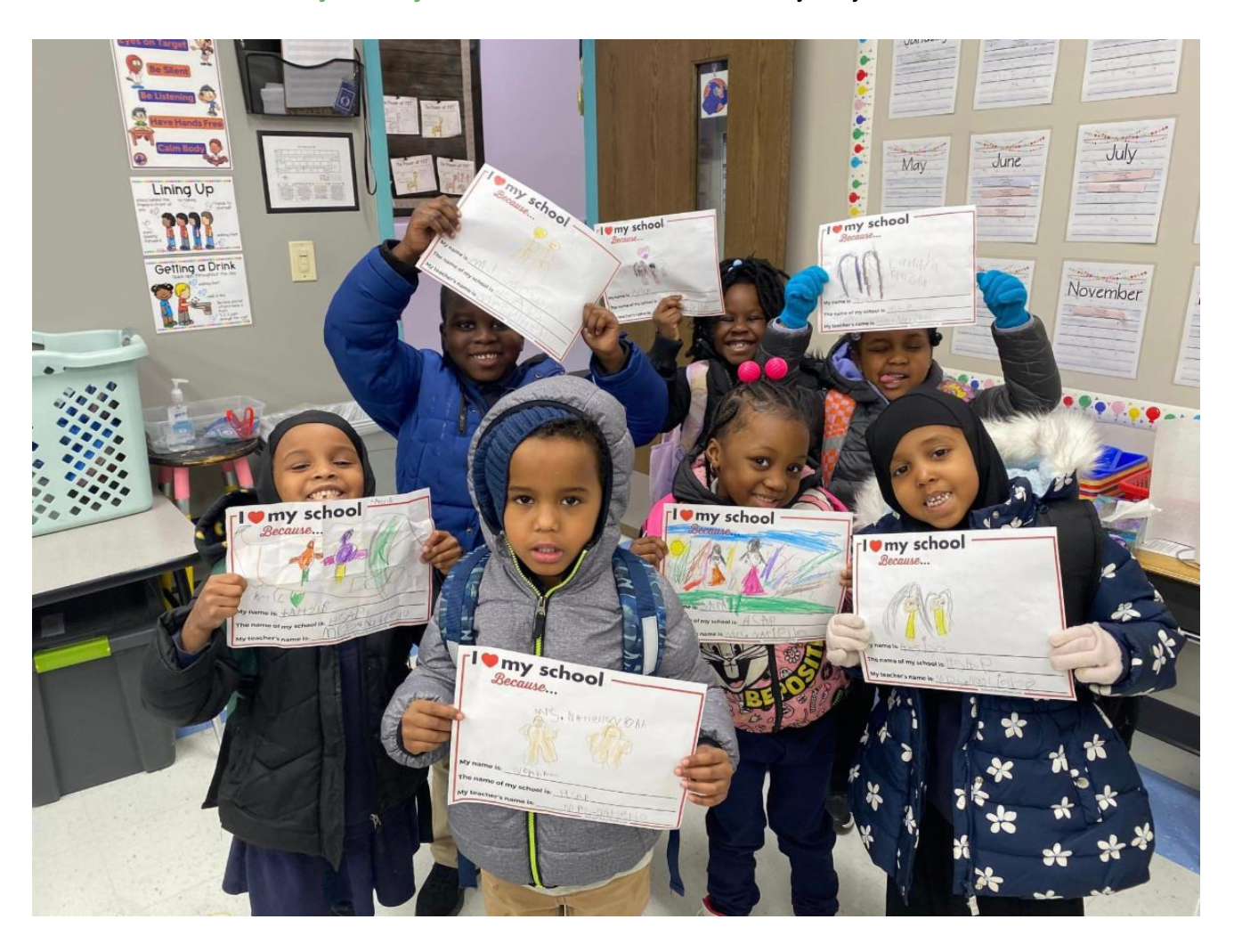
Students at Horizon Science Academy Youngstown had a great time celebrating the week!

Horizon Science Academy Primary School students wrote about why they love their school.