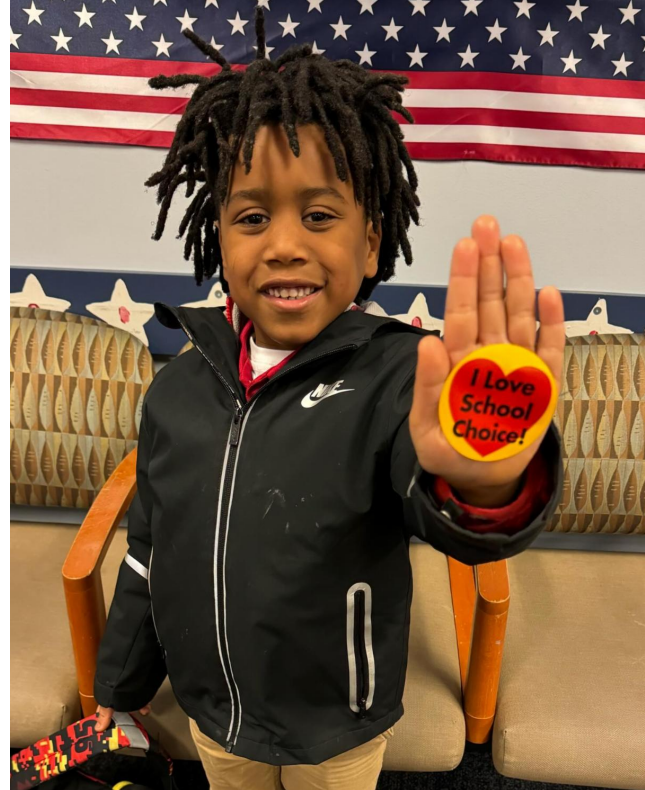
Main Preparatory Academy students showed off their school choice stickers and illustrated why they love their school.