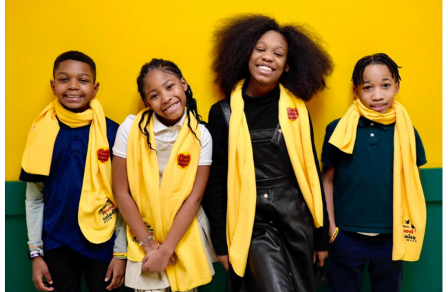
Students at L. Hollingworth School loved their stickers.